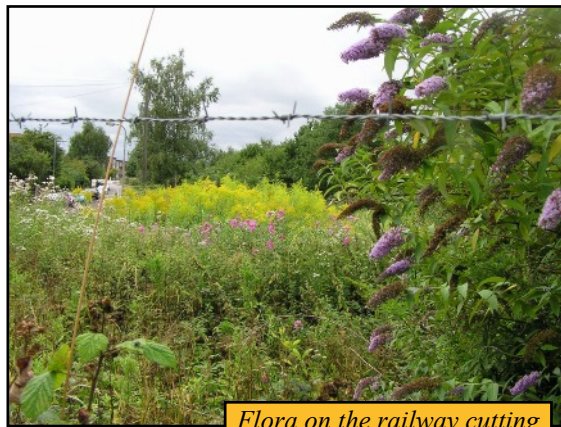
Flora on the railway cutting

Residents have already expressed concern about the height of some of the buildings, parking provision and loss of trees. On the plus side though, these plans do seem far better than previous planning applications for the site.