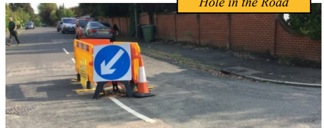
Hole in the Road

The local council's budget for 2019/20 has assumed an increase of 3% in council tax next year. The final decision will be made in February 2019.