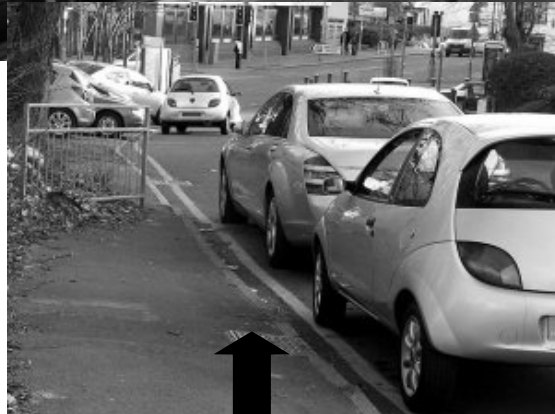
Frequent abuse of yellow lines: This example from West Street on the boundary of Town and Stamford wards

YOU CAN HELP CAMPAIGN FOR ACTION—SEE BACK PAGE